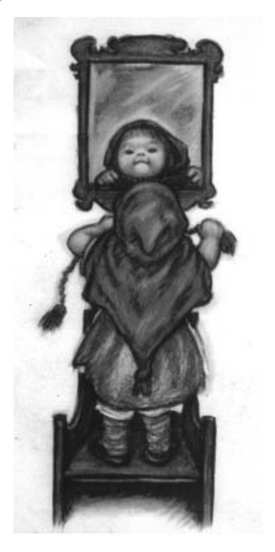
Illustration by Monika Laimgruber (Grimm and Grimm 1993: unpaginated).