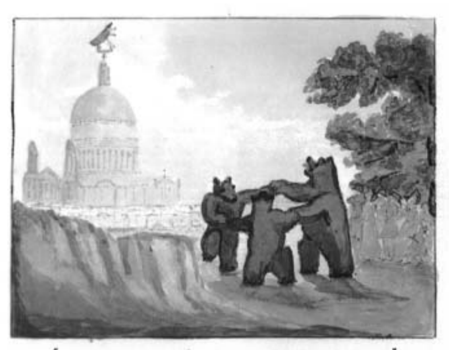
And chuck her aloft on St Paul's church yard steeple:

Illustration by Eleanor Mure (Mure 1967: unpaginated, final illustration).