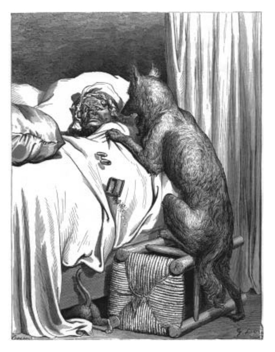
Illustration by Gustave Doré (Perrault 1969: 24).