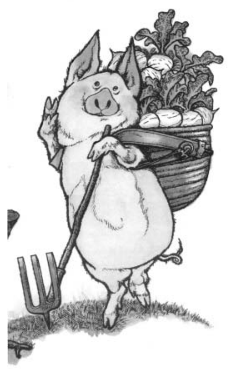
Illustration by Saburo Yamada (Seta 1960: 10).